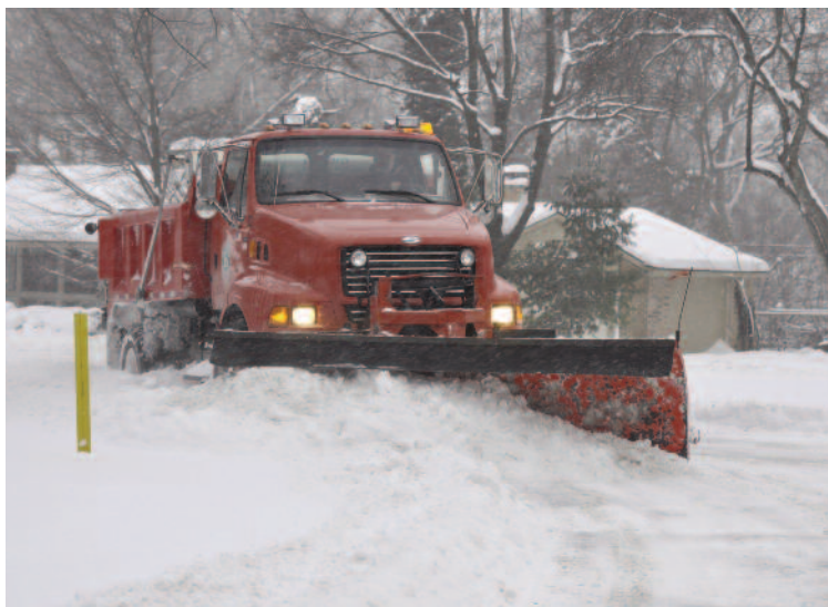
The trucks are ready to roll for the upcoming winter.

when the thermometer stood at minus-15 degrees. There are already ominous predictions that we will have more of the same, if not worse, this winter. Indeed, the Township has been informed that the cost of road salt has already doubled for this