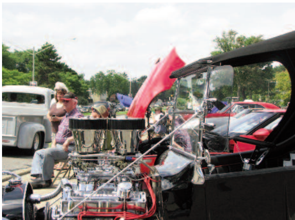
The Classic Car Show site provided the perfect place to view the passing Cruisers while drivers displayed their own wheels.

Held Saturday, Aug. 16, the Dream Cruise marked its 20 th anniversary this year. And this was the 10 th year that the Township staged its popular Dream Cruise events: the Bloomfield Township Classic Car Show and the Bill Wells Car Club Classic. Both were