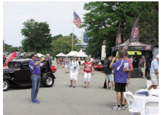
Cars, food and fun abounded at the Township Dream Cruise events.