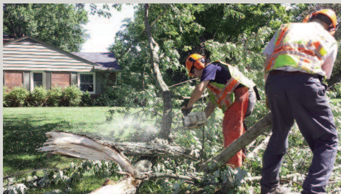
Road Division crews worked long hours to clear storm debris from Township roads.

nature of our water and sewer division. They are constantly videoing sewer lines to find any potential blockages. If someone has a water backup our crews will come in to make sure the main lines are clean. This proactive approach helps keep property damage to a minimum when the 100 year rainfall occurs (which seems to happen every other year).