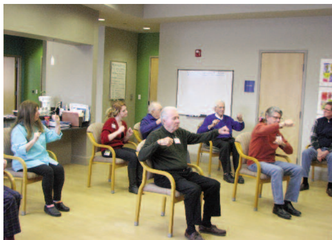
Seniors take part in an exercise class at the Friendship Club, at the Senior Center.

"We are so pleased to see that voters supported Senior Services at such a high level,"