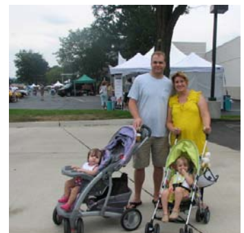
Families enjoyed the Classic Car Show

your calendar now for the third Saturday in August next year and plan to come!