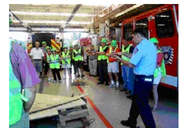
Township firefighters conduct CERT training

For more information about Bloomfield Township CERT see the website, http://www.bloomfieldtwp.org/Services/Fire/CERT.asp