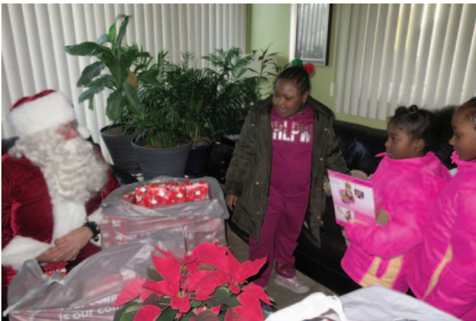
Santa had bags of gifts for a special family.