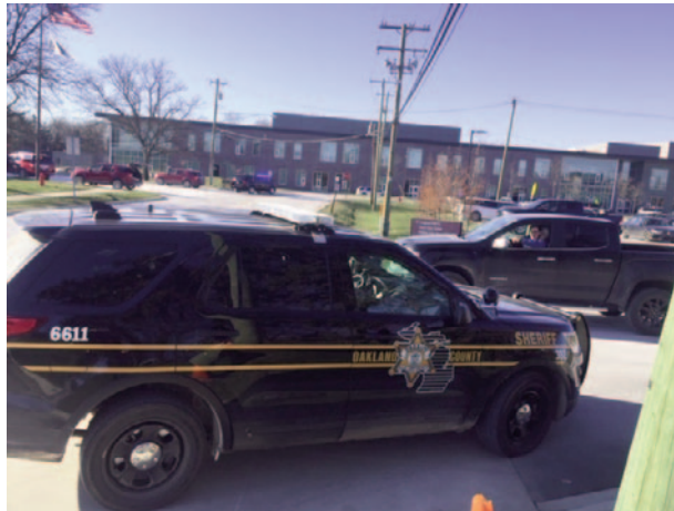
Within minutes after the alarm sounded, police secured the school area.

a host of other communities. Even a helicopter was brought