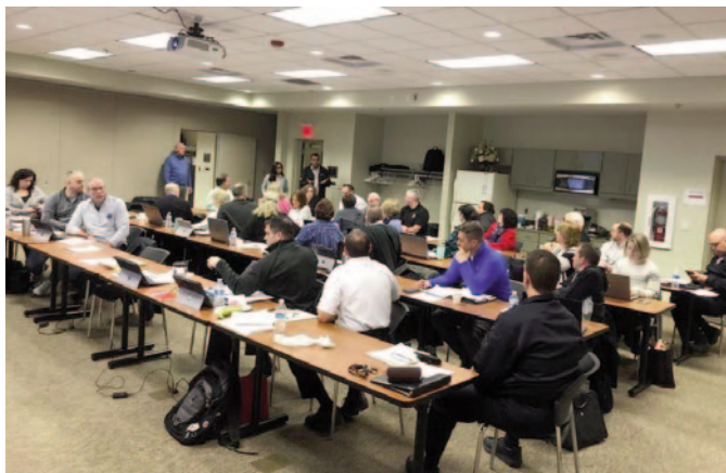
Elected Officials, Department Heads and other staff met in the Emergency Operations Center to discuss plans for handling the COVID-19 crisis.

Early on the Township began making preparations for what could be a serious disruption of life for everyone in the Township including residents, businesses people, Township staff and even visitors to the community. Over the years the