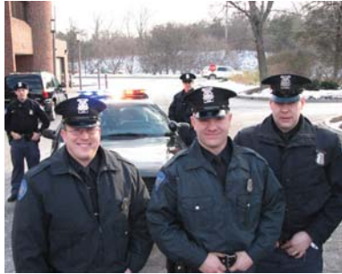
All Township officers are trained to save lives

When you need help in an emergency, you need it immediately. One stark example of this occurred in August, 2008, when a man collapsed while jogging on the outdoor track at Lahser High School. Another person happened to be nearby, called 9-1-1 and began performing CPR. Two police officers arrived even before EMS could get there and quickly took over the CPR that the Good Samaritan had begun. Then they used the Automatic External Defibrillator (AED), standard equipment in our Township, to start the man's heart. Shortly after, the Bloomfield Township Fire Department arrived and continued the man's emergency care until an ambulance got him to a hospital. Because of the officers' training, professionalism and proximity to the scene, someone had another chance at life.