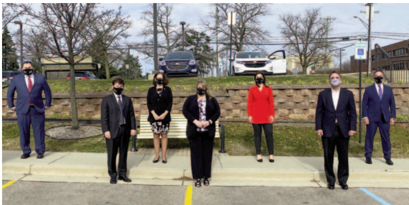
It was a very different kind of swearing in for the new Board of Trustees, held outdoors, masked, and socially distanced.

Police and Fire increased their safety protocols in 2020 to face the pandemic, but continue to focus on everyday safety tips. BTFD reminds you to take precautions while staying warm this winter and offers