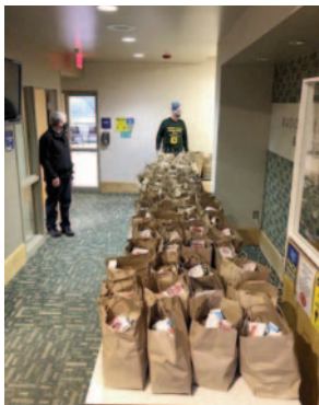
Meals on Wheels is a popular service.

been offered to all adults in the community, including those under age 50, and have