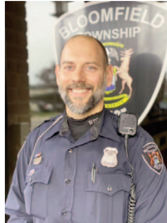
Police officers grew beards to raise money for charity.

The beards are on their way out, but our officers had a lot of fun growing them and supported many great causes. From October to January officers were able to grow facial hair, outside of policy, by donating to the specific cause each month. In the month of October we raised over $1,400 for