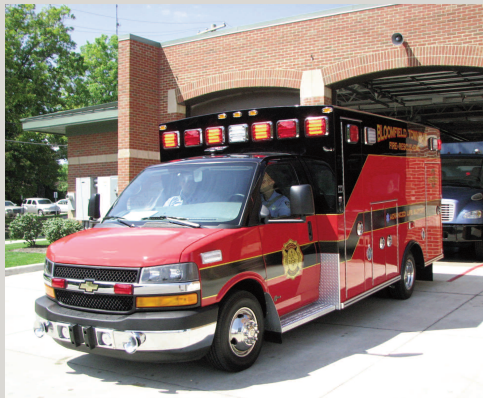
Emergency services and road maintenance are two vitally important services that Township millages support.

I've been in business a long time and I've served as a servant of the people of the