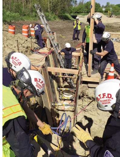
Firefighters work on a trench rescue.

In the scenarios the victim was trapped under a sewer pipe at the bottom of the trench. The firefighters had to find a way to support the walls while rescuing the victim safely. Firefighters from other communities also take part in the training.