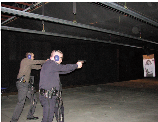
Township police officers undergo regular training in all aspects of police work.