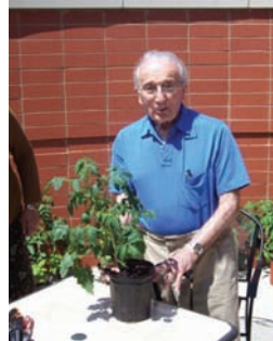
Clients can garden on the patio