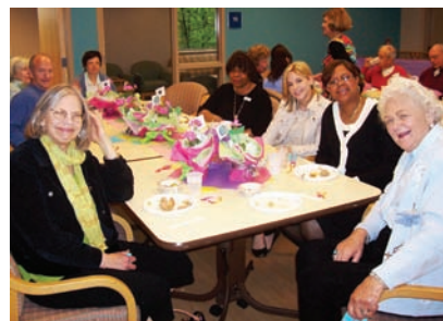
Volunteers enjoy lunch

Staff has found that in many cases families hesitate to sign up their loved one for the Friendship Club. Many families don't feel that their loved one is ready for the club but once they are seasoned members, families wish they had joined sooner. They often say they would encourage other families