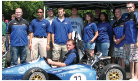
Lawrence Tech student display