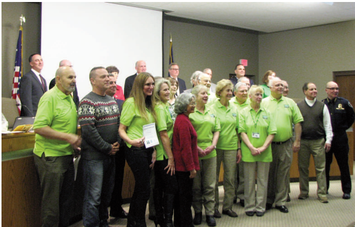
The CERT volunteers (most in green shirts) received certificates of appreciation from the Township.

They're there in case of an emergency. They are the members of the Community Emergency Response Team, or CERT. They are also member of the community who have volunteered to assist the Township public safety officers when needed.