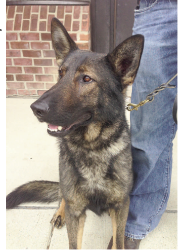
Max loves to go to work.