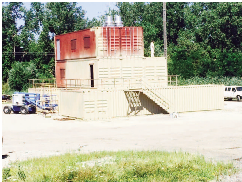
The training structure in the process of being painted.

And now it even looks better. The structure was recently painted a pleasing tan color.