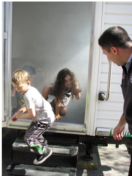
Kids tumble out of the "smoke house," which mimics an actual burning building.

A Beaumont Hospital helicopter made a precise landing on the Township campus,