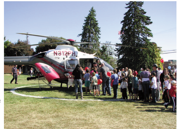
The Beaumont Hospital emergency helicopter was a popular draw.

every bedroom. The Open House was held in conjunction with Fire Prevention Week, Oct. 4-10, with the theme of "Hear the Beep where you Sleep."