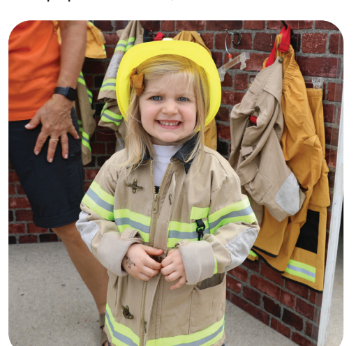
Young girl dresses up in fire gear at the Fire Department during the 2023 Open House.

feature the "Dog House Build" alongside other games at the Environmental & Engineering Services tent. Community Partners, such as the Bloomfield Township Public Library, Oakland County Health Department and more, will set up