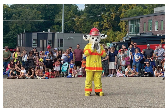
Sparky entertains a large crowd at the Fire Demonstration during the 2023 Open House this past October.

Some of my favorite highlights in 2023 were being able to bring back services, create stronger relationships with regional partners, and increase the scope of technology, training and education we use to ensure we serve and protect our community to the fullest. After a 5-year hiatus, it was amazing to the smiling faces as we celebrated by gathering to share in the excitement of the Open House, to protect the environment at both the Spring e-waste & shredding and the Fall household hazardous waste events, and investing in public safety as demonstrated by adding more first-responder positions and purchasing top of the line lifesaving equipment. We will be adding another community gathering event in 2024, details will be coming your way soon!